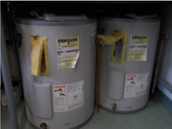
There are two under-counter electric water heaters, but one doesn't work, and there is never enough hot water.