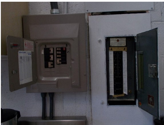
Electric Boxes: The breakers / fuses in the right box are not even available anymore.