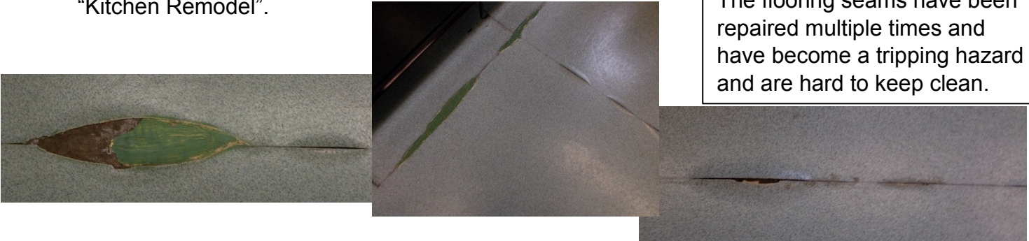
The flooring seams have been repaired multiple times and have become a tripping hazard and are hard to keep clean.

If at any time you would like to make a contribution to support the remodeling, a fund has already been set up. Just mark your envelope or check "Kitchen Remodel".